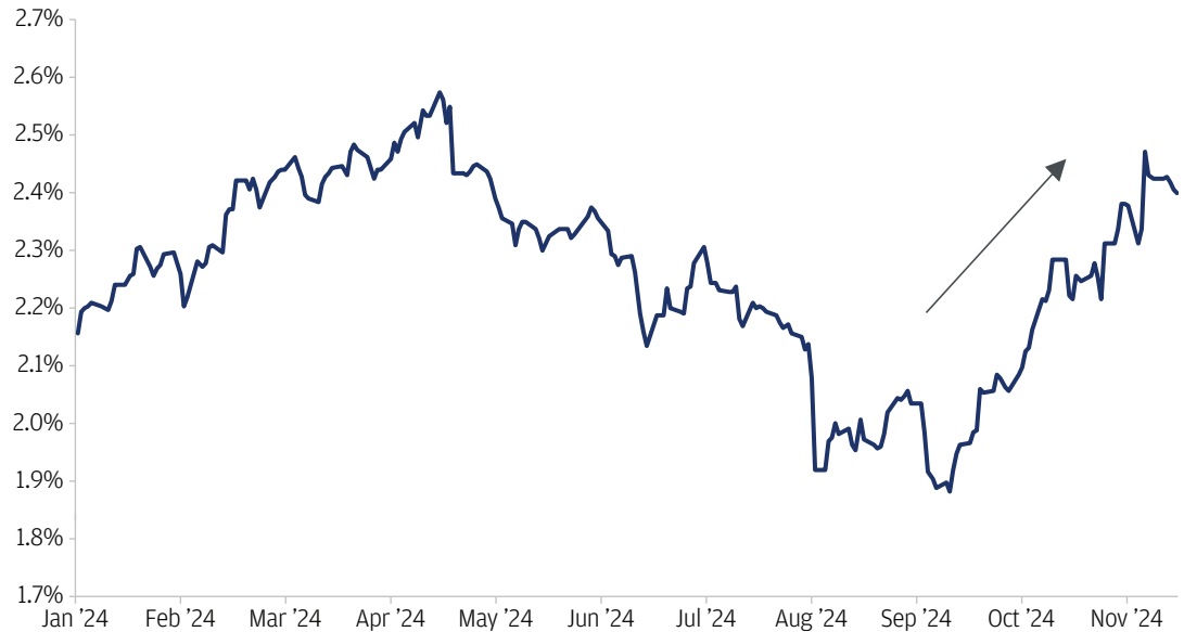
EXHIBIT 2: U.S. FIVE-YEAR BREAK-EVEN INFLATION RATE (2024-YTD)

Data as of November 15, 2024. Breakeven inflation rates are calculated by subtracting the real yield of the inflation-linked maturity curve from the yield of the closest nominal Treasury maturity.