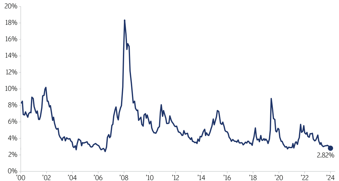
EXHIBIT 3: AVERAGE SPREAD OF THE BLOOMBERG U.S. CORPORATE HIGH YIELD INDEX (2000-YTD)

Data as of November 15, 2024.